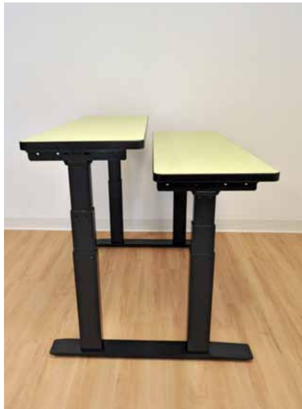
surf2 bilevel table